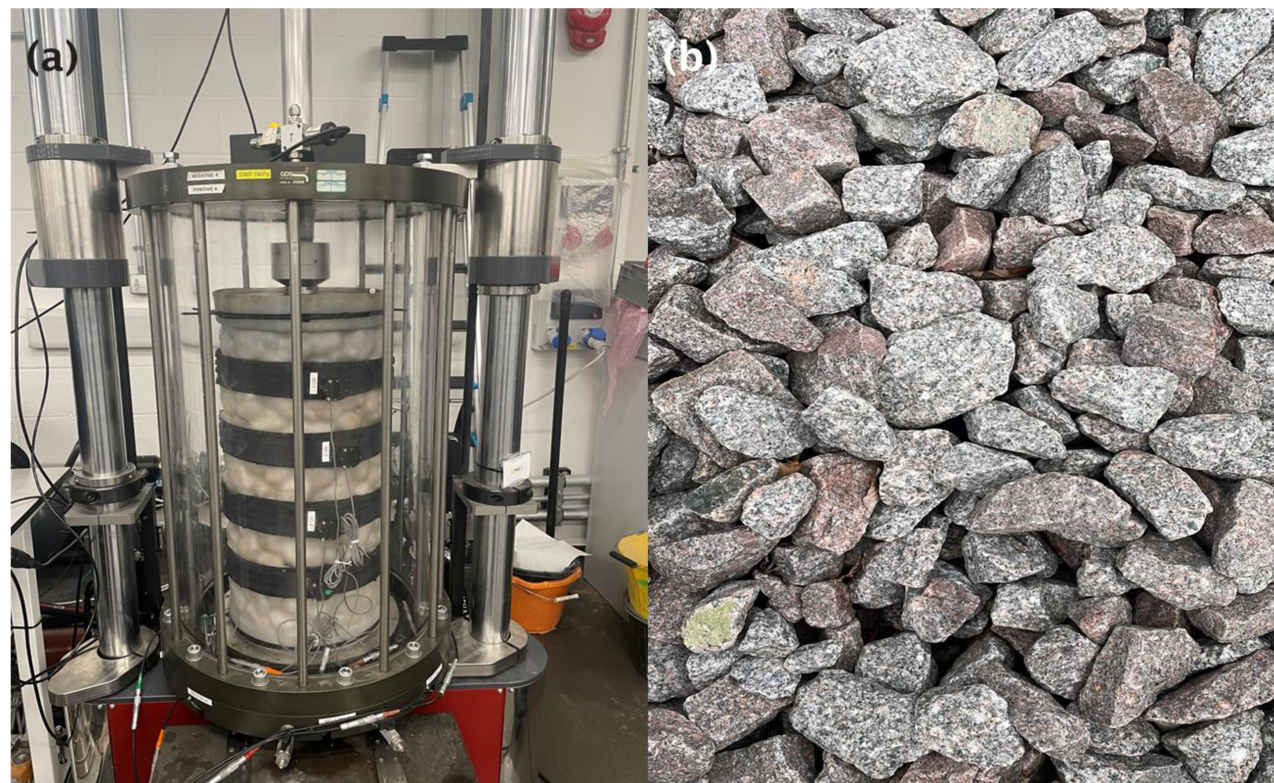
(a) Triaxial Setup (b) Full-scale Montsorrel ballast