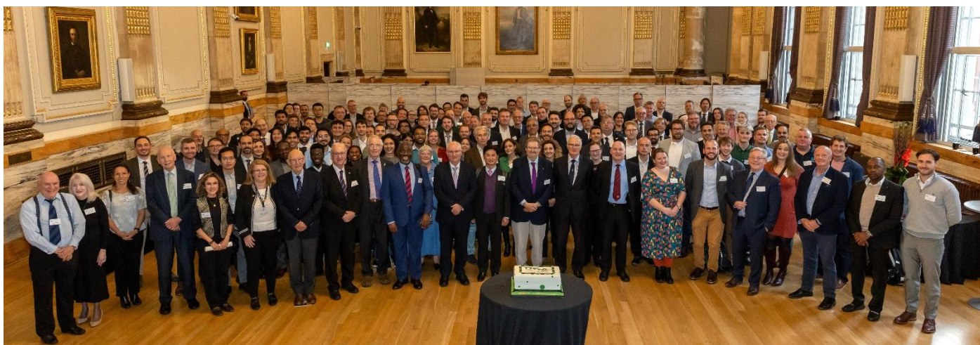
Celebrating 75 years of the BGA. Thank you again to everyone that made it happen, not just the day, but those that have, over so many years, made the BGA the community it is.

We encourage you to take full advantage of the opportunities coming up - whether at the AGM and Annual Conference in June, Earthworks 2025 in September, or by lending your expertise in the ISSMGE paper reviews. Wishing you all an enjoyable summer.